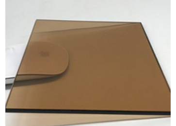
BRONZE TOUGHENED GLASS