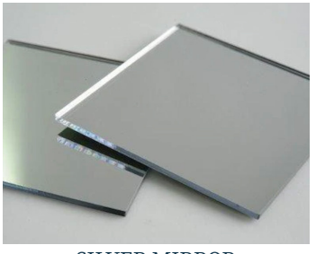
SILVER MIRROR WITH BACKING VINYL