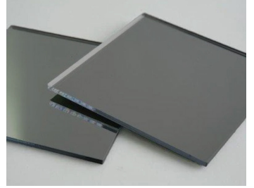
GREY MIRROR WITH BACKING VINYL