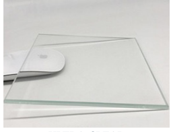
ULTRA-CLEAR TOUGHENED GLASS